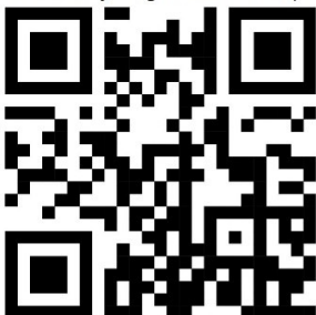
Follow my Progress on The Map